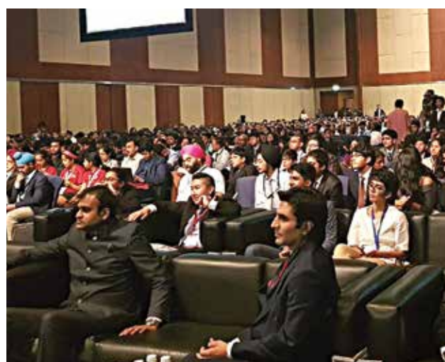
Students from over 150 schools in India and 10 other countries and the Harvard Model United Nations (HMUN) India 2017 annual conference