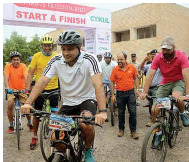
Participants at the India@75 Freedom Ride

A 70 Km Ride (symbolic of India@70) along a sanitized route for experienced riders. More than 200 riders participated in different categories besides fun rides around the venue. India@75 medals were presented to first ten participants completing the signature ride.